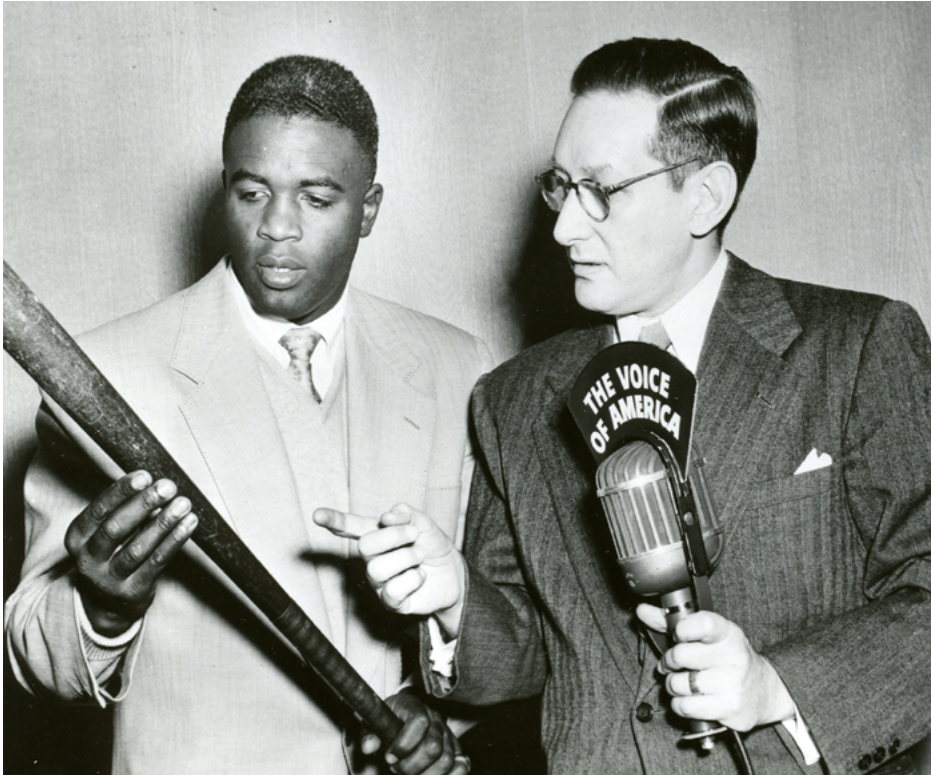
Jackie Robinson interviewed on Voice of America, 1950s

Examine the image and then record your responses to the prompts.